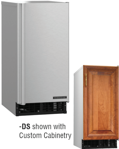
-DS shown with Custom Cabinetry