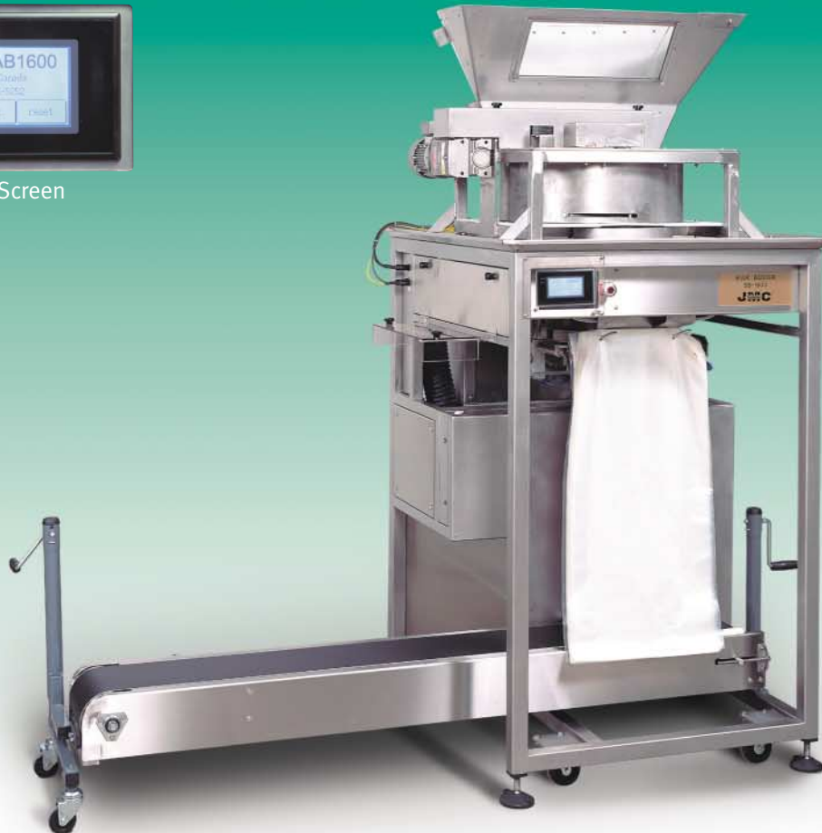
BB 1600 WITH MOBILITY KIT

Automatic Bulk Bagger capable of receiving a large volume of product into a poly bag.